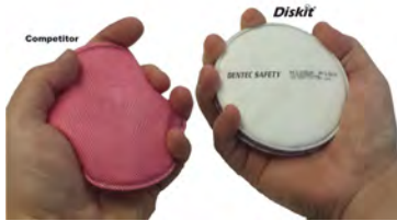
Rigid Internal Frame

Lightweight and ultra-low profile, the Diskit® revolutionizes comfort and compatibility.