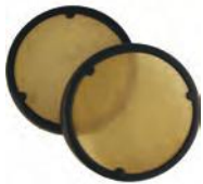
14885 Diskit® SparkShield Cover 1/Pair

The Diskit® adapter allows you to convert any of the Comfort-Air cartridges into a P100 combination cartridge. Simple attach the adapter to any of the cartridges and attach the DiskitP100 to the adapter. Simple, easy and will reduce cartridge consumption costs by more than 50%.