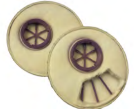
Diskit® Cartridge Construction