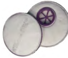
Offset Filter Connector

Lightweight and ultra-low profile, the Diskit® revolutionizes comfort and compatibility.