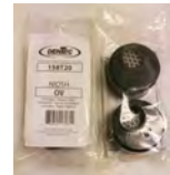
Twin Pack Cartridge Packaging